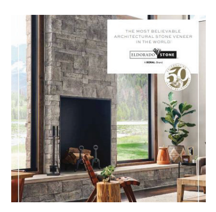
STONE + BRICK BROCHURE Find the perfect stone for your next project.