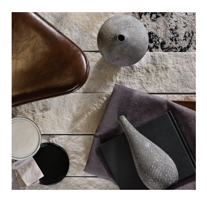
MOOD BOARDS Explore our gallery of carefully curated mood boards.

STONE 101 GUIDE Learn the key differences between natural and manufactured stone.