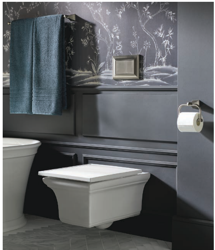
Kohler’s Memoirs wall-hung toilet frees up square footage, with a design that offers a nod to crown molding.