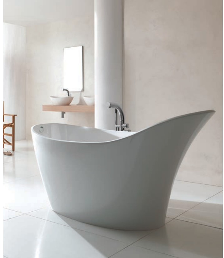
Victoria + Albert’s Amalfi freestanding modern slipper tub, available in seven exterior colors, measures 64 inches long—an ideal size for small baths.

Experts indicate that the most popular configuration is a stationary showerhead combined with a handheld showerhead. “The handheld showerhead is a must for cleaning the space,” say Moore and Sprangers. “Consumers are interested in different spray options, along with digital thermostatic valves and interfaces.” The next step up would also include an overhead rain showerhead.